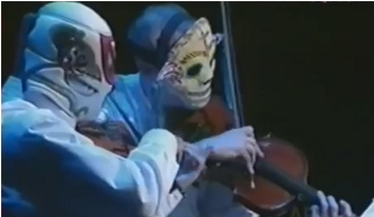
Gabriela Ortiz' "Altar de Muertos"

Saturday, November. 1, 2014 8pm Rio Theatre, Santa Cruz